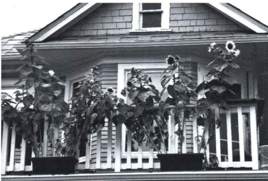
A CROP OF SUNFLOWER SEEDS RIPENS ON A SECOND STOREY IN CLIFF BUNGALOW LAST SUMMER.